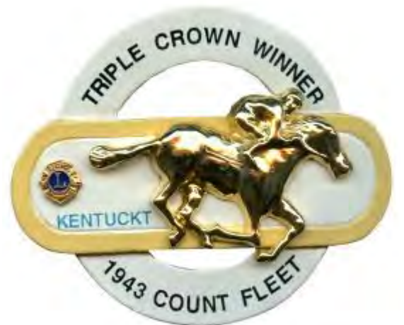
1999 Special V "KENTUCKT"