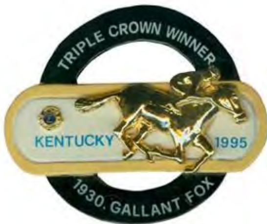
1995 Special 2