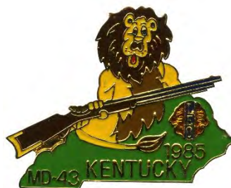
1985 Leo Large

NOTE: This is the small regular LEO pin.