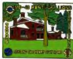
2006 Mini New Orleans