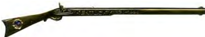
1990 Special 1