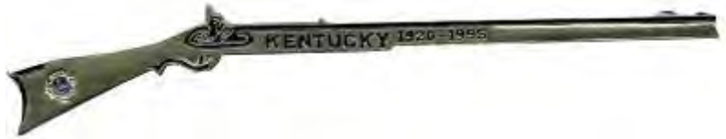
1995 Special 1